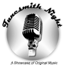
A Showcase of Original Music Presented by the Wallowa Valley Music Alliance