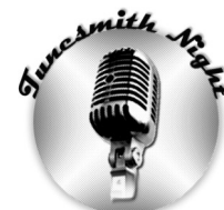
A Showcase of Original Music Presented by the Wallowa Valley Music Alliance